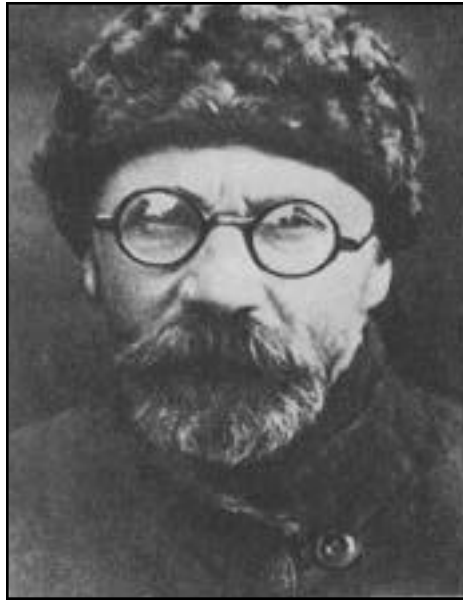
Leonid Kulik, the first researcher into the Tunguska explosion.

The effect of the Installation was so powerful that in the 10 days before the explosion, in many countries of Europe as well as western Siberia, the darkness of night was replaced by an unusual illumination as if those areas were experiencing the "white nights" phenomenon of high-latitude summers. Everywhere there appeared, shining brightly